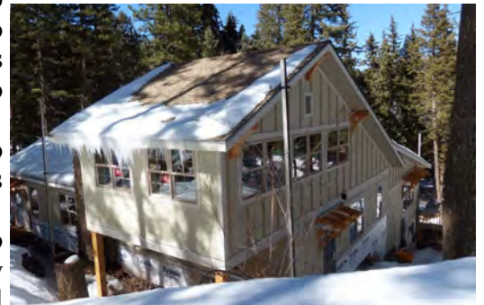
Upper hill view of Lily's Pad

We are extremely proud of our new Marathon and so excited to have you all see it, use it, and enjoy it. This new space will house Shields, the Archery Hut, the Radio (in Lily's Pad – complete with lilies and frogs), Camp Store (that may adopt the name "Trading Post," or "Marathon Mercantile"), as well as a greatly enlarged play space, program, and performance area. The kitchen holds its own program area for varied activities involving food and nutrition. Grateful praise to all who helped to bring this dream to fruition.