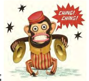
Recognizable, perhaps, but NOT Charlie!