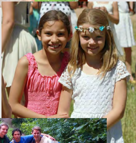
The "spirit of the Glen" evidenced by the friendships made and renewed each summer