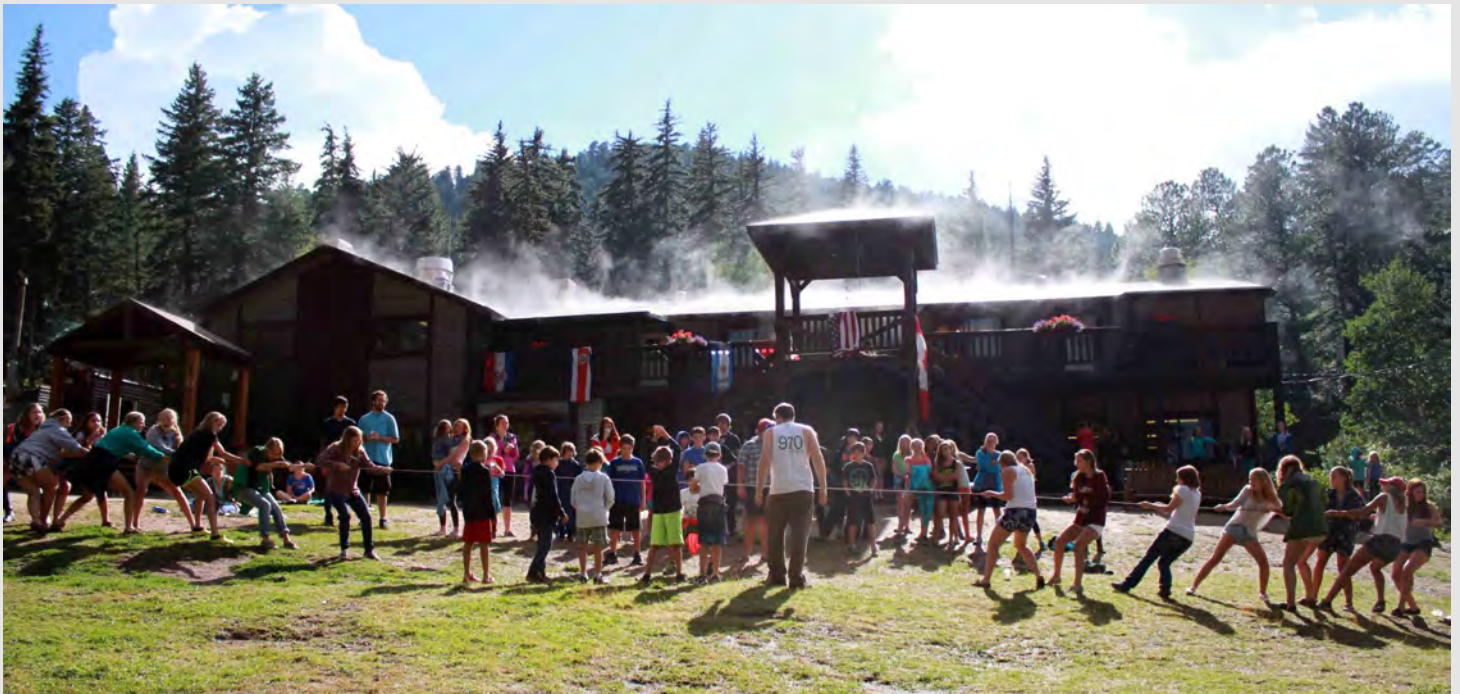
Last summer was a quite unusual in the amount of rain we received! This made us even happier to be building a new and enlarged Marathon! This photo is dramatic showing what it looks like at GG following a downpour (which chased everyone in to their cabins and dorms), and a full blazing sun!